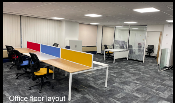
Office floor layout